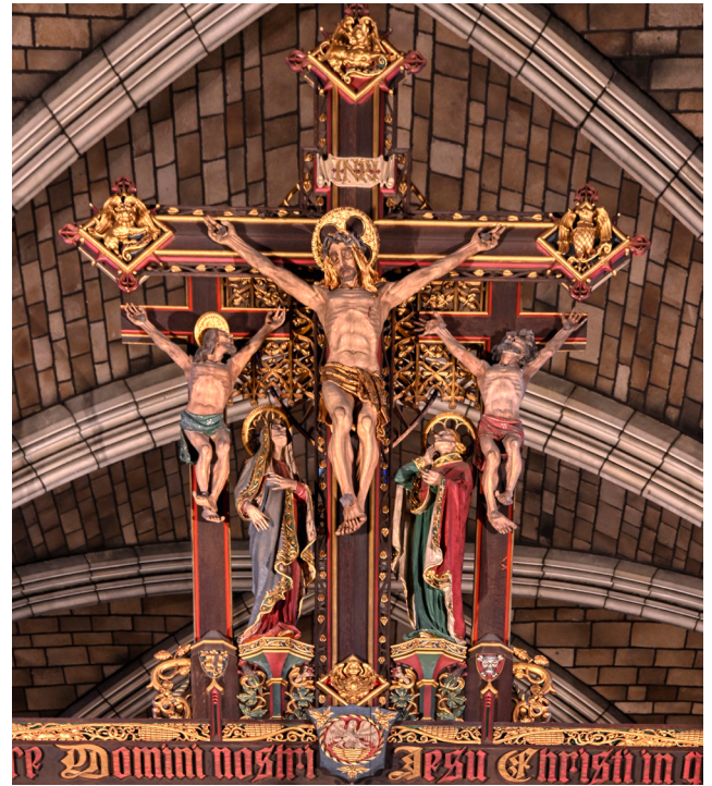
Rood beam, St. Vincent Ferrer Church, New York

This sort of procession through the cross does not end there, though. As we come to receive the Blessed Sacrament at Mass, we are then led into a sort of reverse procession from the altar to the pew and back into the world. At each and every Mass, we enter into the reality of Christ's paschal mystery. His passion, death, and resurrection are once again presented to us in such a way as to pour out the fruits of those mysteries into our lives even now. In a very real sense, we pass from rood to rood and back again. We pass through the cross at Mass, and, being strengthened by its fruits through the graces of the Mass and through Holy Communion, we then become Christ's emissaries in the world as we depart and bring Christ wherever we go.