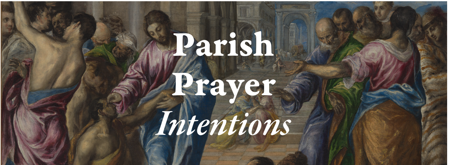
"Christ Healing the Blind," El Greco, 1570