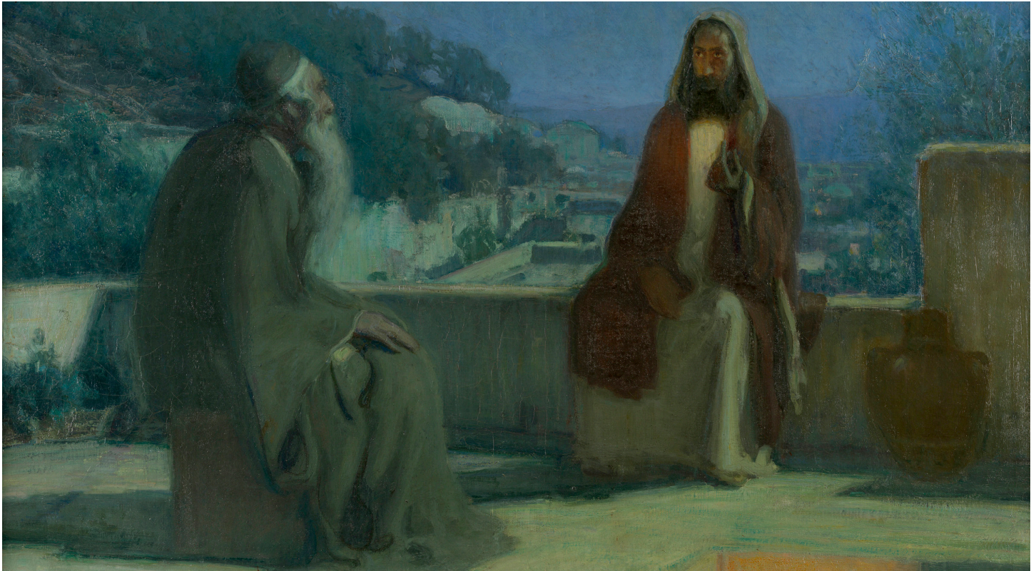
"Nicodemus," Henry Ossawa Tanner, 1899, Pennsylvania Academy of the Fine Arts, Philadelphia, PA

September 14, 2025 | Feast of the Exaltation of the Holy Cross