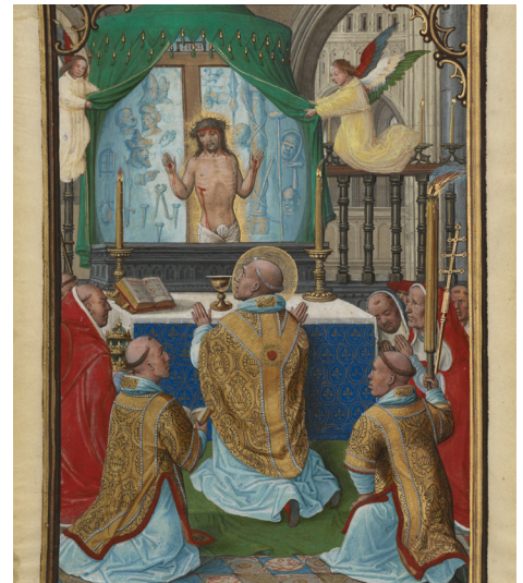
"The Mass of Saint Gregory" Simon Bening, 1535 - 1540, Getty Museum

To arrange for the baptism of a child at St. Vincent Ferrer or St. Catherine of Siena please visit our website, svsc.info/baptism to download the Baptism request form. Once completed, email it to parish@svsc.info . A priest will be in touch with you to set up a meeting and schedule the Baptism.