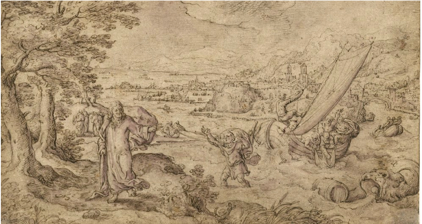
"Jesus Appears to His Disciples at Lake Tiberias," Hans Bol, 1573, Museum Plantin-Moretus, Antwerpen, Belgium