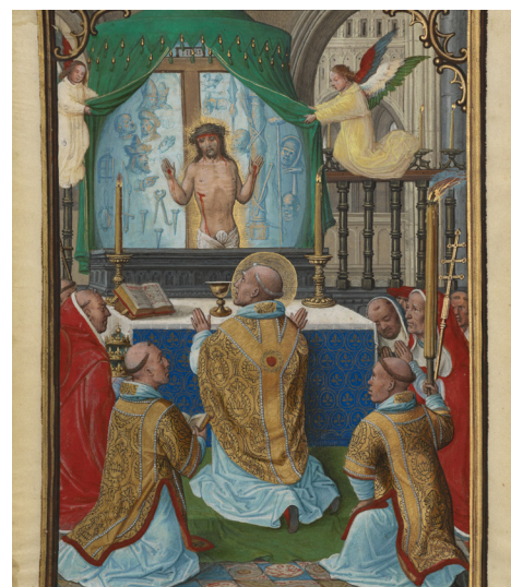
"The Mass of Saint Gregory" Simon Bening, 1535 - 1540, Getty Museum

To arrange for the baptism of a child at St. Vincent Ferrer or St. Catherine of Siena please visit our website, svsc.info/baptism to download the Baptism request form. Once completed, email it to parish@svsc.info . A priest will be in touch with you to set up a meeting and schedule the Baptism.