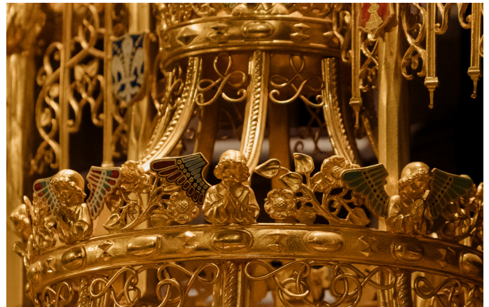
Crowns of the Porta Caeli and the Tabernacle St. Vincent Ferrer Church, New York

the tabernacle, the God who was carried in the arms of the Porta Caeli beckons us to be crowned with faith so that we can see that He has truly come to dwell among us and to be carried in our minds and hearts.