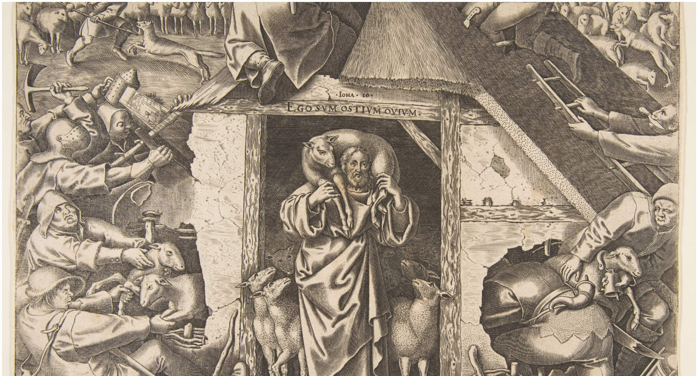
"The Parable of the Good Shepherd," Philip Galle after Pieter Bruegel the Elder, 1565, National Gallery of Art, Washington, DC