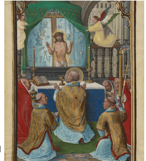
"The Mass of Saint Gregory" Simon Bening, 1535 - 1540, Getty Museum

To arrange for the baptism of a child at St. Vincent Ferrer or St. Catherine of Siena please visit our website, svsc.info/baptism to download the Baptism request form. Once completed, email it to parish@svsc.info . A priest will be in touch with you to set up a meeting and schedule the Baptism.