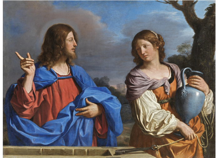
"Christ and the Woman of Samaria at the Well," Guercino, 1640-1641, Museo Nacional Thyssen-Bornemisza, Madrid

Whatever the cause, the Lord is inviting us to be courageous. This doesn't mean that we can be impetuous, rash, or imprudent. Rather, it's about seeing the daunting task that is good but hard to attain and not being bound by shame or fear. Courage is about rising above the pressures that are keeping