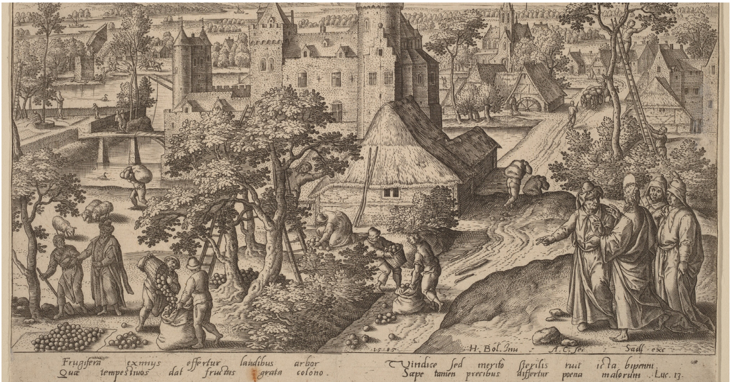
“The Parable of the Barren Fig Tree,” Hans Bol, Adriaen Collaert, 1585, National Gallery of Art, Washington, DC