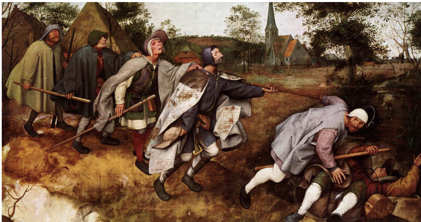
"The Blind Leading the Blind," Pieter Bruegel the Elder, ca. 1568, Museo e Real Bosco di Capodimonte, Napoli, Italy

March 2, 2025 | Eighth Sunday in Ordinary Time