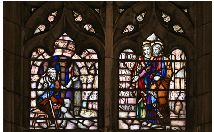
Detail of Holy Name Chapel Window (cf. Acts 3:1-8), St. Vincent Ferrer Church, New York City

For prayer, it could be helpful to pick a vice that you’re struggling to break free from or a virtue that you’re hoping to cultivate and to make that the intention for your time in prayer. For example, if you’re struggling with pride, then you might offer a daily Rosary, weekly Stations of the Cross, or weekly holy hour to break that vice and grow in the opposite virtue, i.e. humility. St. Joseph’s in Greenwich Village (the other Dominican Parish in Manhattan) has a perpetual adoration chapel, and it could be wonderful to sign up for an hour each week and to beg the Lord to help you grow in virtue. Moreover, giving up something like social media and replacing it with spiritual