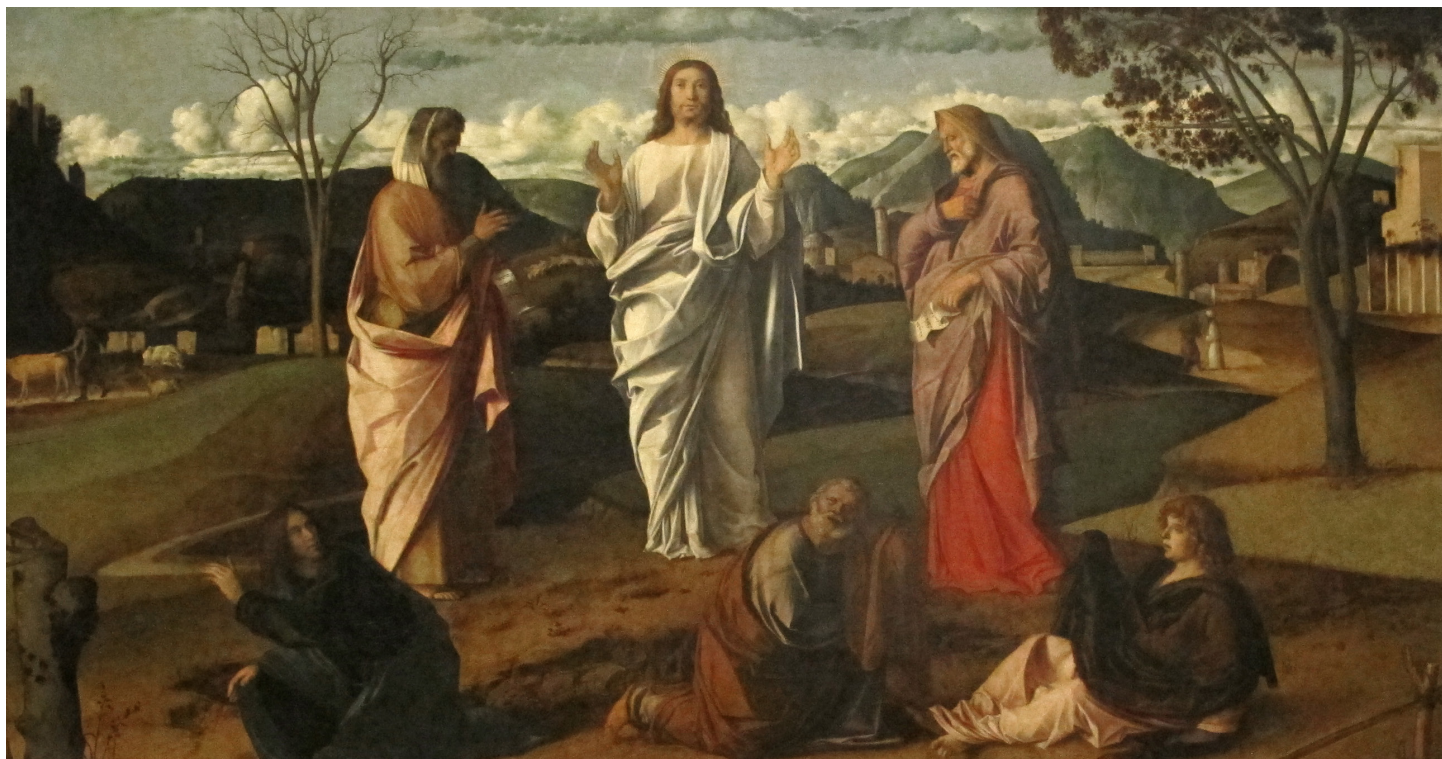
"Transfiguration of Christ," Giovanni Bellini, ca. 1478-79, Museo e Real Bosco di Capodimonte, Napoli, Italy