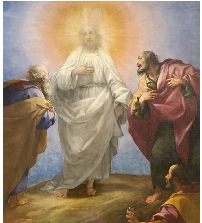
"Transfiguration," Giovanni Battista Paggi, 1596, Church of San Marco, Florence

There are practical things. First, filters and blockers can be helpful for screens. Installing these won't change the heart, but they can help. Second, there are accountability partners. Men should generally