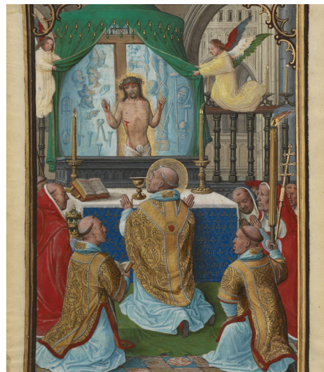
"The Mass of Saint Gregory" Simon Bening, 1535 - 1540, Getty Museum

To arrange for the baptism of a child at St. Vincent Ferrer or St. Catherine of Siena please visit our website, svsc.info/baptism to download the Baptism request form. Once completed, email it to parish@svsc.info . A priest will be in touch with you to set up a meeting and schedule the Baptism.