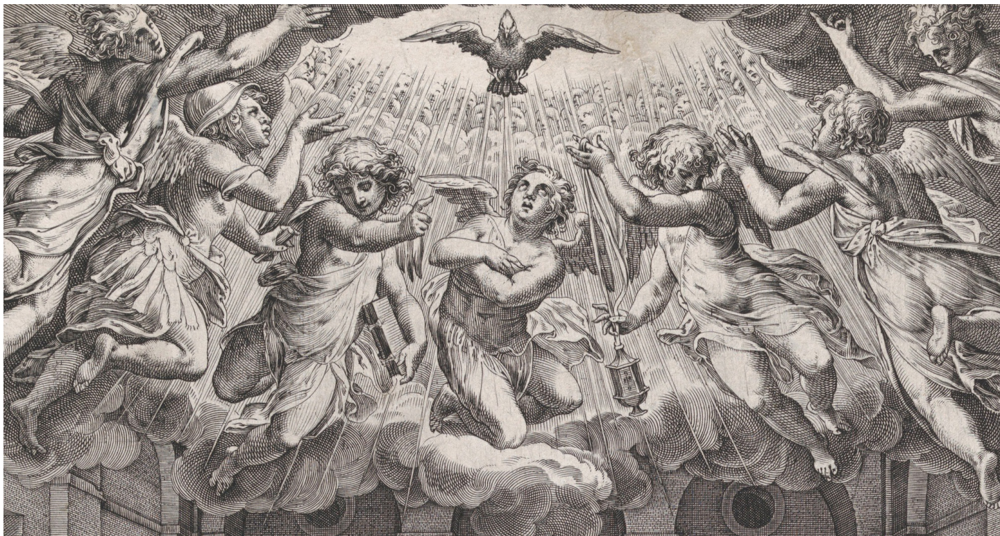
"The Pentecost," Antonio Lafreri, Giorgio Vasari, Cornelis Cort., 1574, The Metropolitan Museum of Art, New York