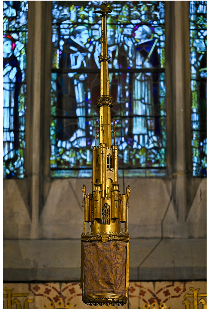
Hanging Pyx, St. Vincent Ferrer Church, New York

All that being said, what do the hanging pyx and the tabernacle invite us into? Union with God. They are the outward symbols of what can be held inwardly. With the Blessed Sacrament in the tabernacle, the Lord rests among us. He sits