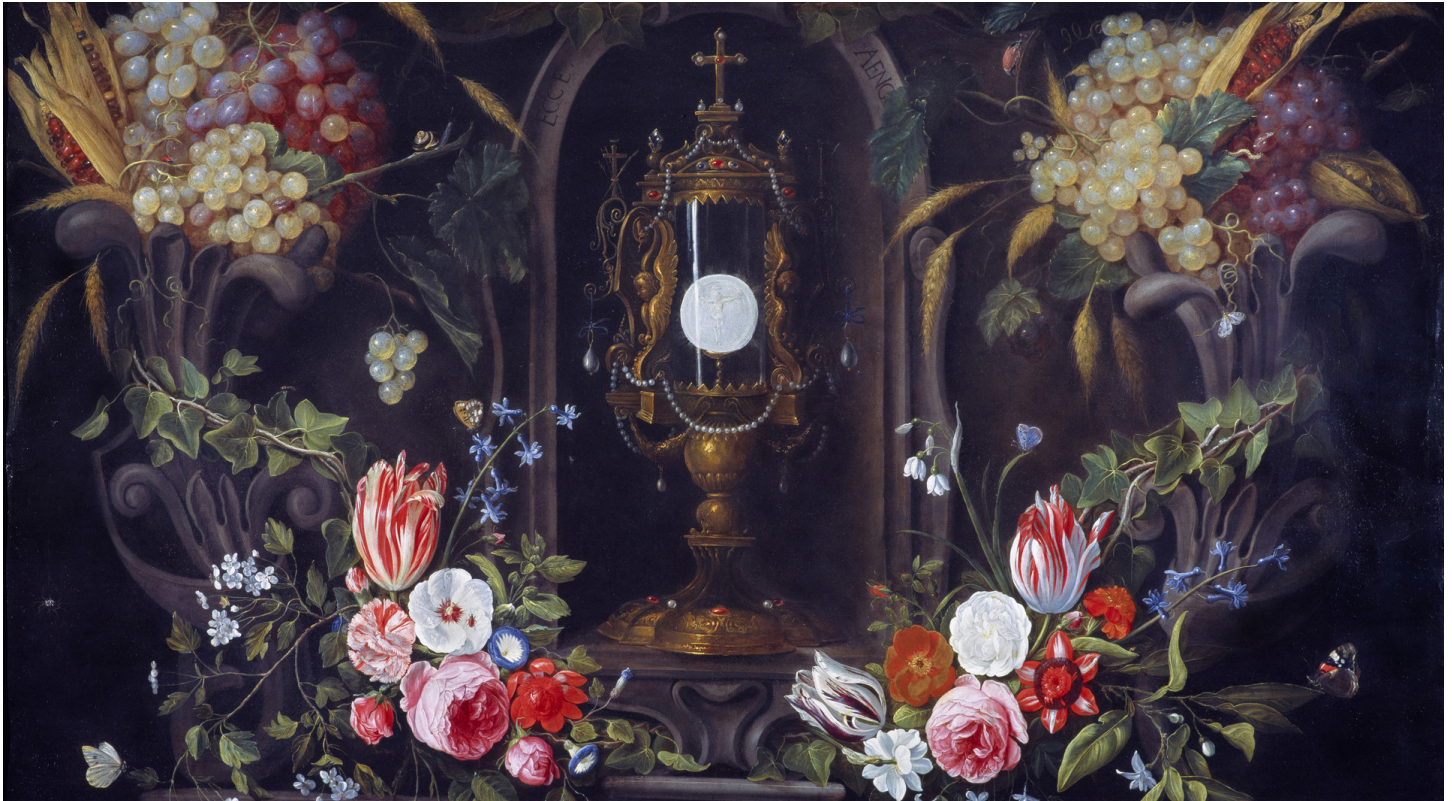
"Corpus Christi," Jan van Kessel, ca. 1670, National Galleries of Scotland

June 22, 2025 | The Most Holy Body and Blood of Christ