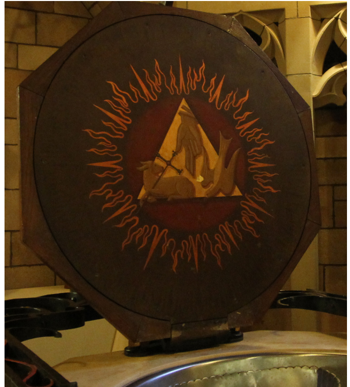
Baptismal Font, St. Vincent Ferrer Church, New York

It's into this life that God invites us through baptism and the other sacraments. God doesn't just want to forgive us our sins. Nor does He just want to fill us with faith, hope, and charity. Even more so, He desires to draw us into His inner life. God wants us to share in the Trinitarian life of the Father,