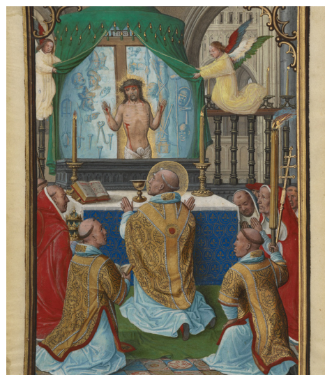
"The Mass of Saint Gregory" Simon Bening, 1535 - 1540, Getty Museum

To arrange for the baptism of a child at St. Vincent Ferrer or St. Catherine of Siena please visit our website, svsc.info/baptism to download the Baptism request form. Once completed, email it to parish@svsc.info . A priest will be in touch with you to set up a meeting and schedule the Baptism.