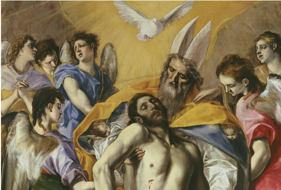
"The Holy Trinity," El Greco, 1577, Museo del Prado, Madrid, Spain

June 15, 2025 | Solemnity of the Most Holy Trinity