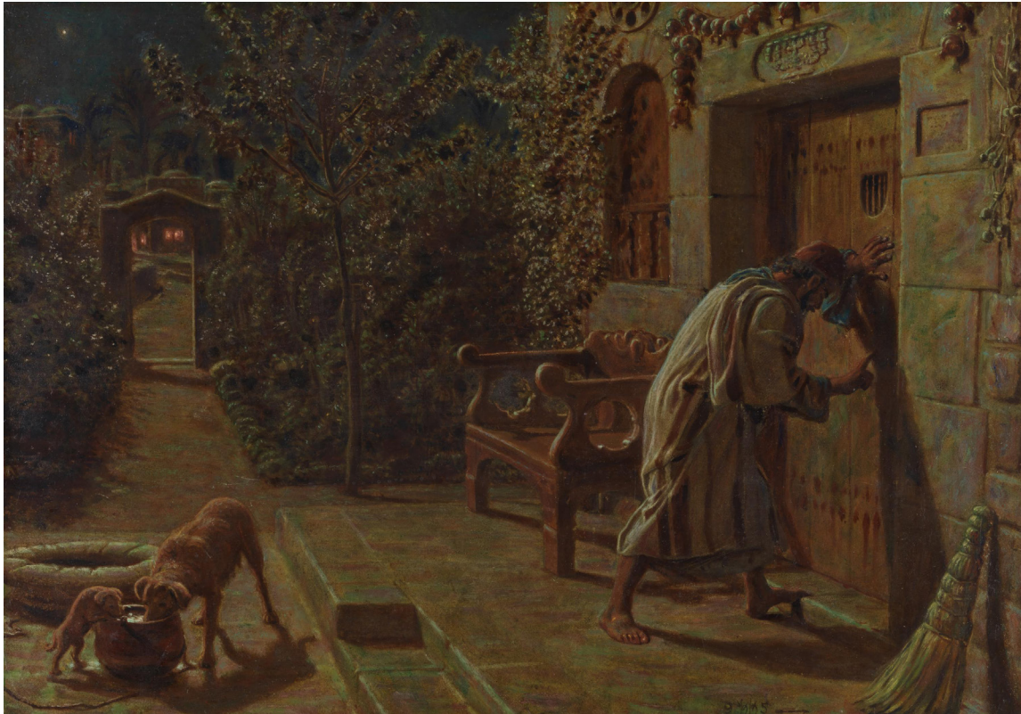
"The Importunate Neighbour," William Holman Hunt, 1895, National Gallery of Victoria, Melbourne

July 27, 2025 | Seventeenth Sunday in Ordinary Time