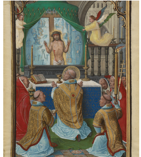
"The Mass of Saint Gregory" Simon Bening, 1535 - 1540, Getty Museum

To arrange for the baptism of a child at St. Vincent Ferrer or St. Catherine of Siena please visit our website, svsc.info/baptism to download the Baptism request form. Once completed, email it to parish@svsc.info . A priest will be in touch with you to set up a meeting and schedule the Baptism.