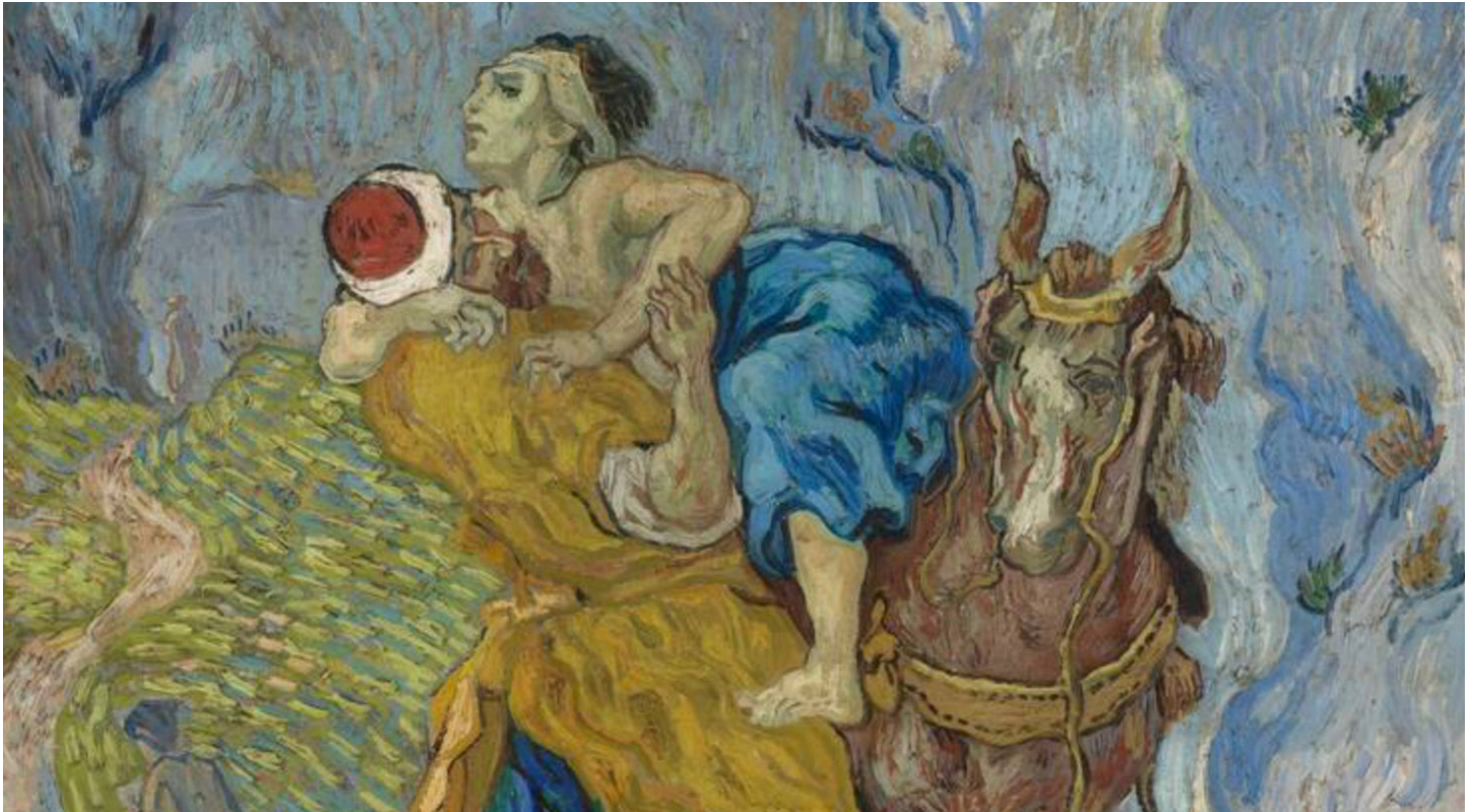
"The Good Samaritan (after Delacroix)," Vincent van Gogh, 1890-05, Kröller-Müller Museum, Otterlo, The Netherlands

July 13, 2025 | Fifteenth Sunday in Ordinary Time