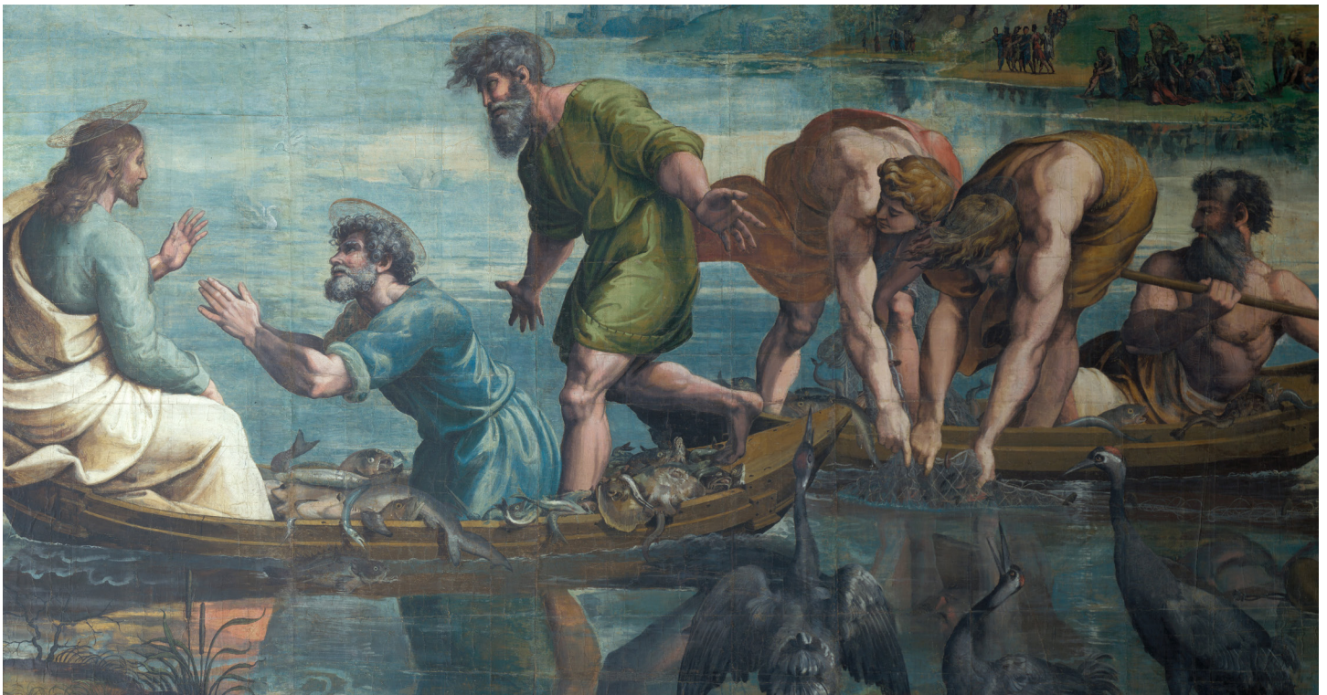
"The Miraculous Draft of Fishes," Raphael, c.1515 - c.1516, Royal Collection Trust, UK

February 9, 2025 | Fifth Sunday in Ordinary Time