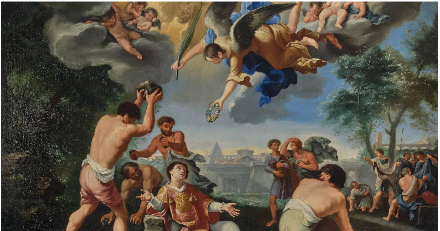
"The Stoning of Saint Stephen," Luigi Garzi, 1682, Private Collection

February 23, 2025 | Seventh Sunday in Ordinary Time