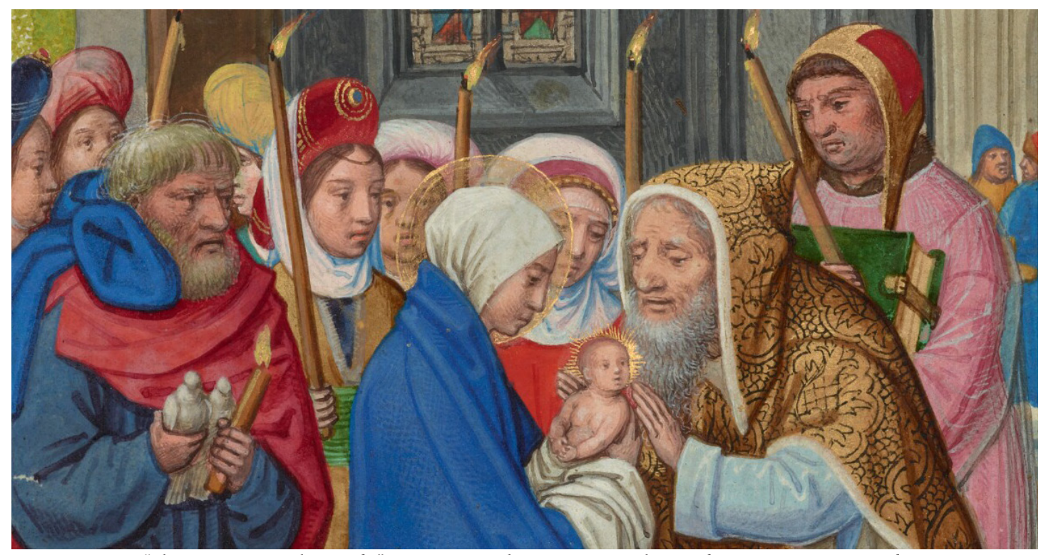
"The Presentation in the Temple," Simon Bening, about 1525–1530, The J. Paul Getty Museum, Los Angeles

February 2, 2025 | Candlemas: The Presentation of the Lord