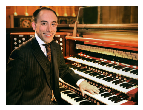
SUNDAY, FEBRUARY 2, 2:30 PM Brass and Organ Concert

O God, who were pleased to give us the shining example of the Holy Family, graciously grant that we may imitate them in practicing the virtues of family life and in the bonds of charity, and so, in the joy of your house, delight one day in eternal rewards. Through Christ our Lord. Amen.