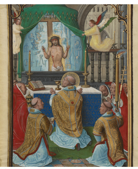
The Mass of Saint Gregory" Simon Bening, 1535–1540, Getty Museum

To arrange for the baptism of a child at St. Vincent Ferrer or St. Catherine of Siena please visit our website, svsc.info/baptism to download the Baptism request form. Once completed, email it to parish@svsc.info. A priest will be in touch with you to set up a meeting and schedule the Baptism.