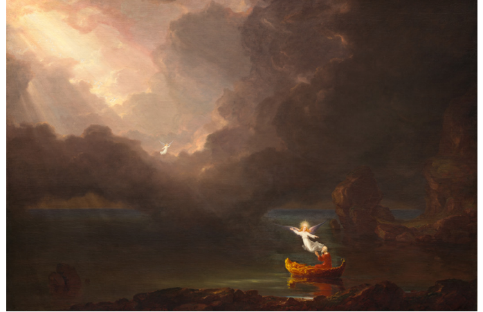
"The Voyage of Life: Old Age," Thomas Cole, 1842, National Gallery of Art, Washington, DC

In the First Reading for this Sunday, we hear from the Prophet Jeremiah who speaks about the tree stretching "out its roots to the stream." It is soaking up the good waters that will nourish it and prevent it from drying up when the heat comes. Jeremiah tells us that even in "the year of drought," it "still bears fruit."