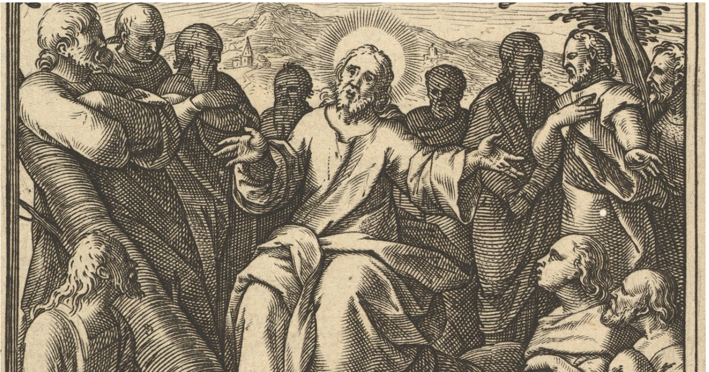
"The Eight Beatitudes," Hendrick Goltzius, Philip Galle, ca. 1578, Metropolitan Museum of Art, New York, NY

February 16, 2025 | Sixth Sunday in Ordinary Time