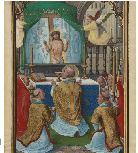
"The Mass of Saint Gregory" Simon Bening, 1535 - 1540, Getty Museum

To arrange for the baptism of a child at St. Vincent Ferrer or St. Catherine of Siena please visit our website, svsc.info/baptism to download the Baptism request form. Once completed, email it to parish@svsc.info . A priest will be in touch with you to set up a meeting and schedule the Baptism.