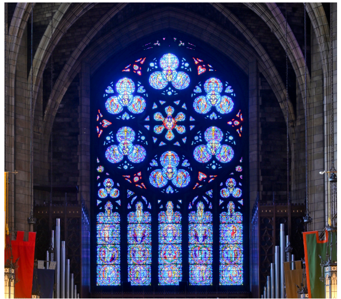
Rose Window Above Main Entrance, St. Vincent Ferrer Church, New York

It is important to see these two sections as being built one upon the other for the window as a whole reveals the path to heaven. It begins with entering into Christ's mysteries. Through meditating on the life, death, and resurrection of Christ in the Gospels, the Rosary, and the Stations of the Cross, we begin to be shaped more and more like Christ. As we are transformed by those mysteries and appropriate their graces, we begin to put on Christ. We start to live in holiness. It's that transformation, that union with Christ, and that path to holiness, which then leads us to the upper part of the window where we see the heavenly court. The saints and angels gather around the throne of God, and we, too, are invited into their company so that we might rest with the Lord and with them for all eternity in the perfect light of heaven. As we hear in Revelation, "The city had no need of sun or moon to shine on it, for the glory of God gave it light, and its lamp was the Lamb" (Revelation 21:23).