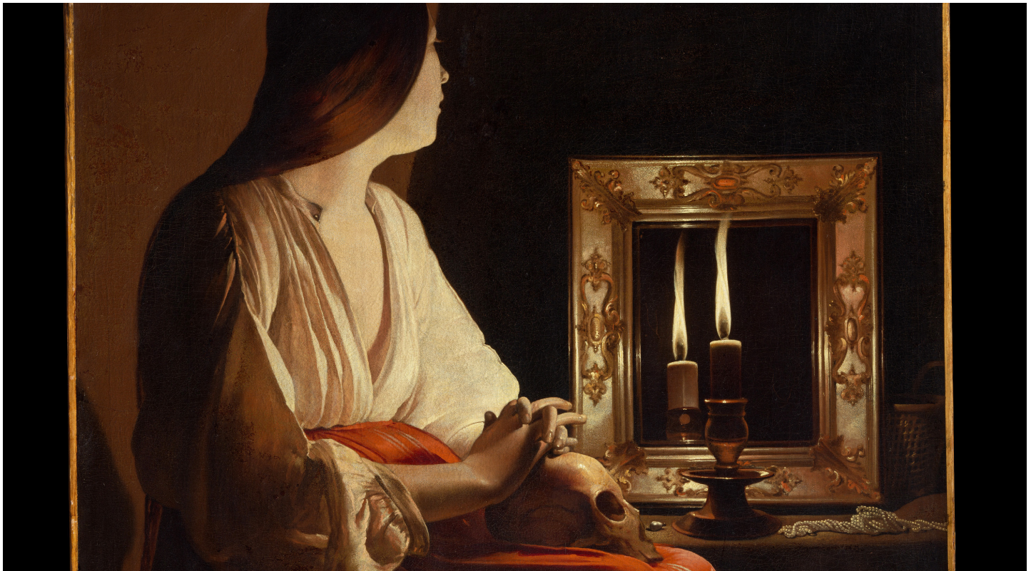
"The Penitent Magdalen," Georges de La Tour, ca. 1640, Metropolitan Museum of Art, New York City

August 10, 2025 | Nineteenth Sunday in Ordinary Time