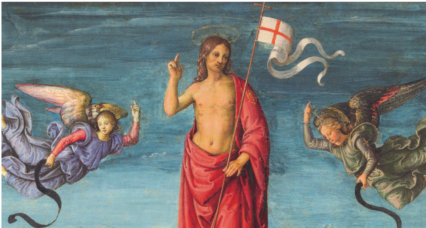
"The Resurrection of Christ," Raphael, 1499 - 1502, Museu de Arte de São Paulo Assis Chateaubriand, Brazil