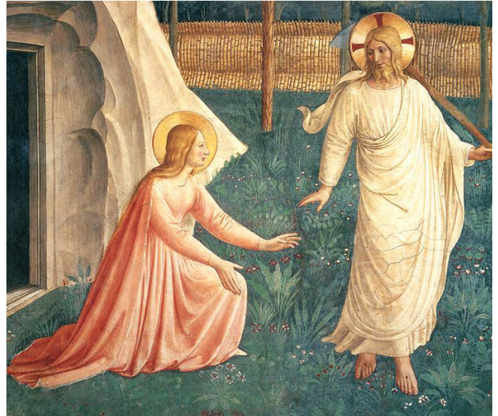
“Noli Me Tangere,” Bl. Fra Angelico, O.P., 1440-1442, Cell 1 in Convento di San Marco, Florence

What is Fra Angelico trying to do with this, though? On the one hand, these white and red flowers represent purity and the Precious Blood. On the other hand, they also seem to represent the water and blood that poured forth from Christ’s side to water the world with baptism (white) and the Eucharist (red). St. Albert the Great beautifully writes, “The Christ-flower [ flos Christus ] blossomed in the Nativity, as we read in Isaiah 11:1: ‘There shall come forth a rod out of the stem of Jesse.’ It withered in the Passion when there was no longer aspect or beauty...It blossomed again at the Resurrection according to human nature, in the very place where it had withered. Thus, it is said: ‘And my flesh blossomed anew’ (Psalm 27:7)” (De laudibus, 12.4.2). In other words, Fra Angelico depicted the truth that Christ has watered all creation in His Passion, which has led to a new garden coming to bloom. This new garden, though, will image Him. The life of the flowers springing up will look like His own glorified life.