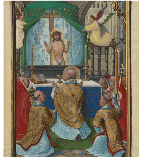
"The Mass of Saint Gregory" Simon Bening, 1535 – 1540, Getty Museum

To arrange for the baptism of a child at St. Vincent Ferrer or St. Catherine of Siena please visit our website, svsc.info/baptism to download the Baptism request form. Once completed, email it to parish@svsc.info . A priest will be in touch with you to set up a meeting and schedule the Baptism.